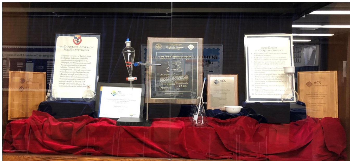
Photographs courtesy of Lisa Zandier, August 14, 2019.